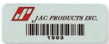
Highly durable barcode labels.

For more information about Firebug contact us at: